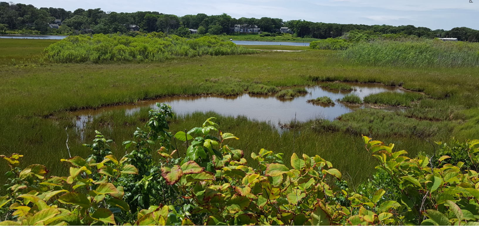
Marsh on Martha's Vineyard