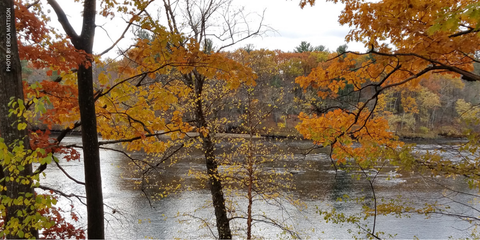
Merrimack River, Haverhill