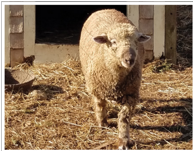
Sheep at River Rock Farm, Westport

Massachusetts has a well-established agricultural sector with over 7,700 farms, 524,000 acres of farmland, and 61,000 jobs. 1 To support this industry and increase access to locally grown foods, the Massachusetts Department of Agricultural Resources (MDAR) must have sufficient resources.