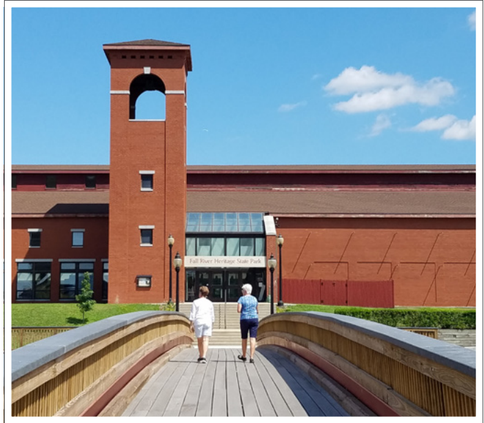
Fall River Heritage State Park

DCR needs to modernize its lease and permit practices to take advantage of revenue opportunities and make sure the Commonwealth is getting a fair deal for private use of public property. If adequate resources are provided to overhaul the lease and permit system, DCR would be able to generate additional revenue that would be reinvested in improving DCR's facilities and level of service.