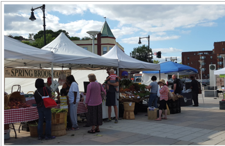
Left: Ashmont/Peabody Square Farmers' Market, Dorchester; Right: Owners of Carr's Ciderhouse in Hadley

MDAR provides support to the Massachusetts Farm to School Project, a nonprofit organization that connects in-state farmers and institutions to improve access to locally grown foods and strengthen our agricultural economy. A recent survey by the Project revealed that 320 public school districts, private schools, and colleges in the Commonwealth prioritized serving local foods, over half of which have received assistance from the Mass Farm to School Project.