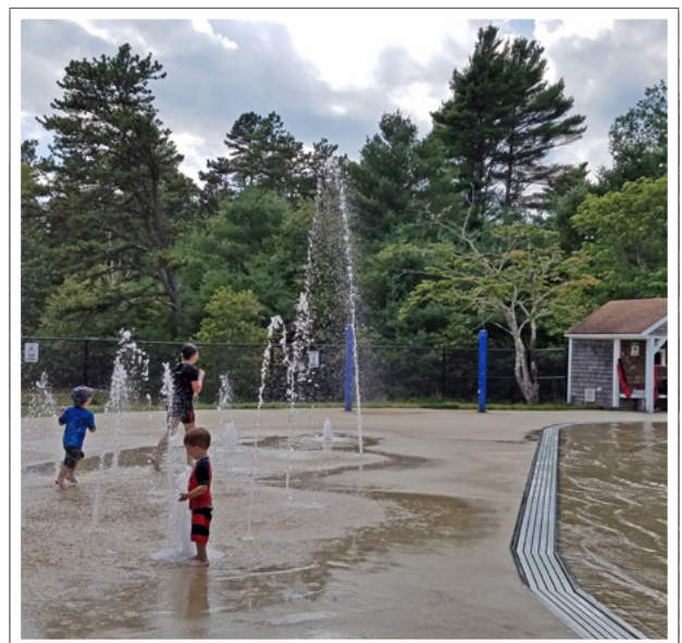
Wading pool at Freetown-Fall River State Forest