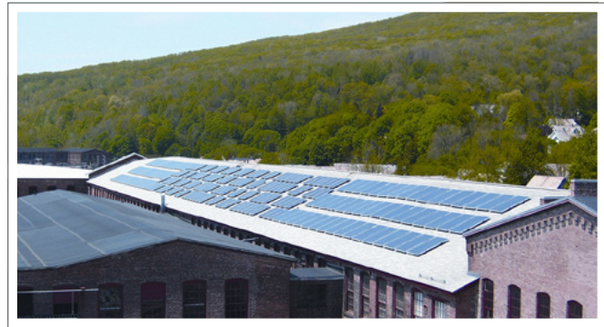
55 kW rooftop solar array in North Adams