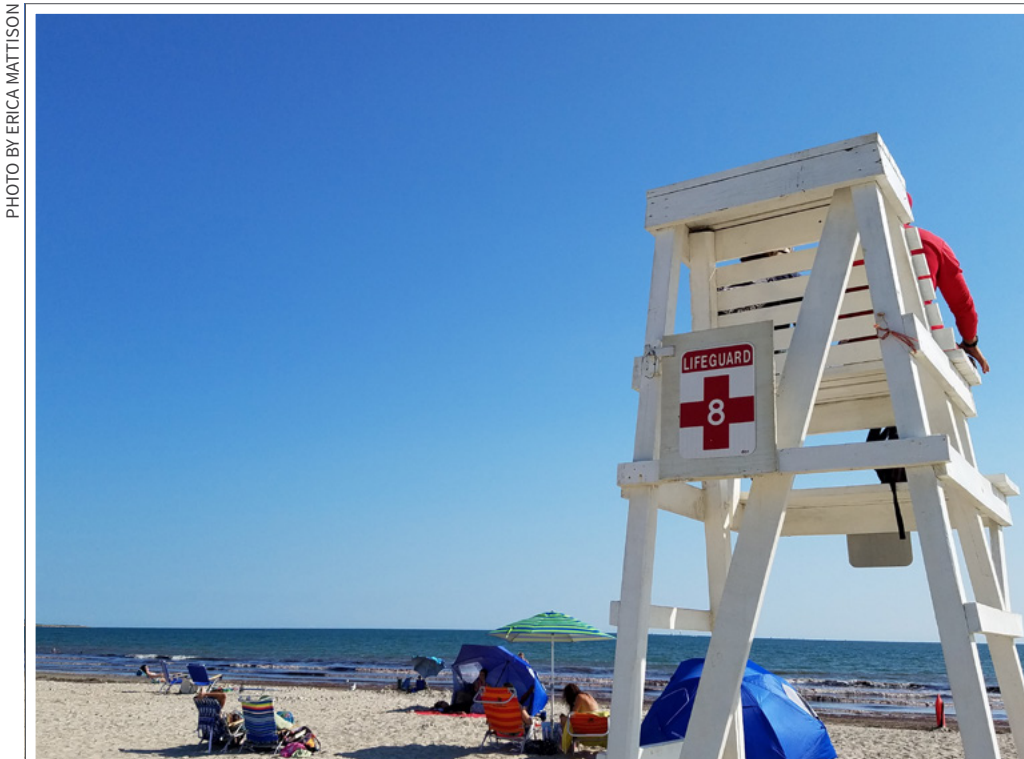
Horseneck Beach, Westport