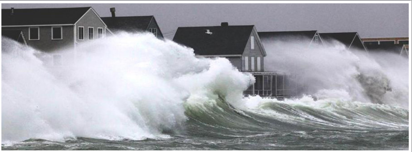
Storm in Scituate