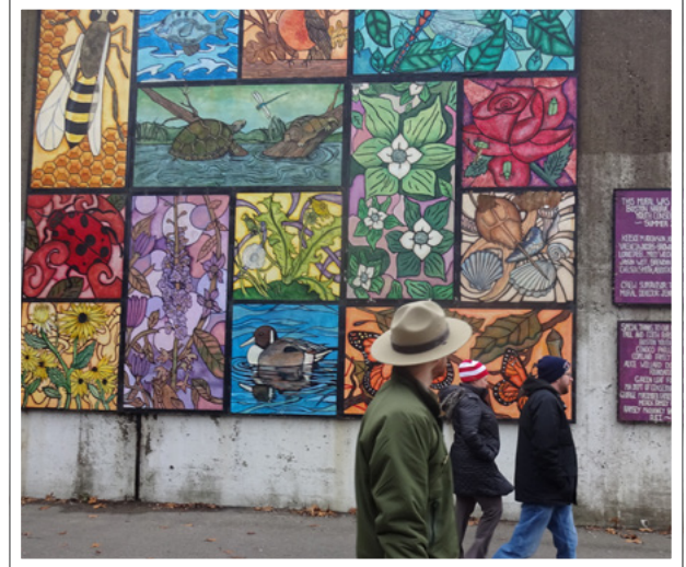
Neponset River Greenway, Dorchester

The Department of Conservation and Recreation (DCR) is responsible for the stewardship, management and safety of our parks, beaches, forests, pools, skating rinks, and campgrounds. Overall, 450,000 acres of land come under DCR's purview, spread across more than 250 properties.