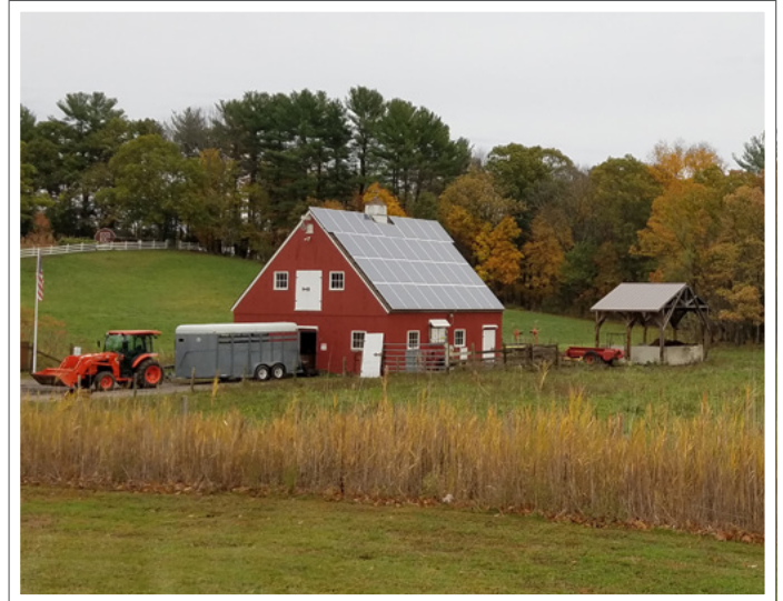
Farm with solar panels in Northeastern MA