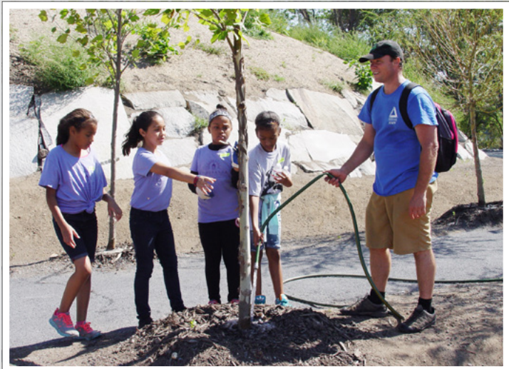
2015 Spicket River Cleanup