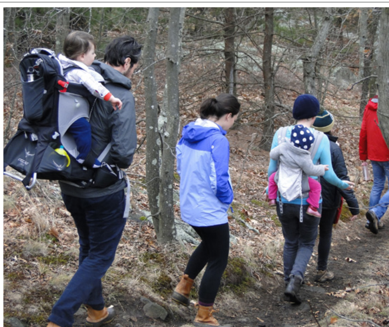
Friends of the Fells' Babes in the Woods Program helps children connect with nature