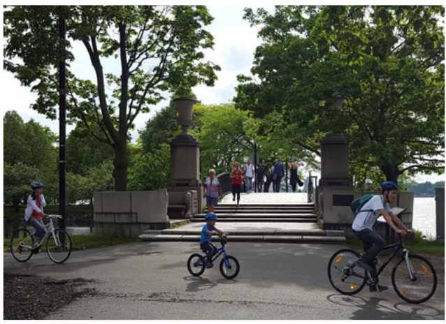
Bicycling in the Esplanade along the Charles River, Boston