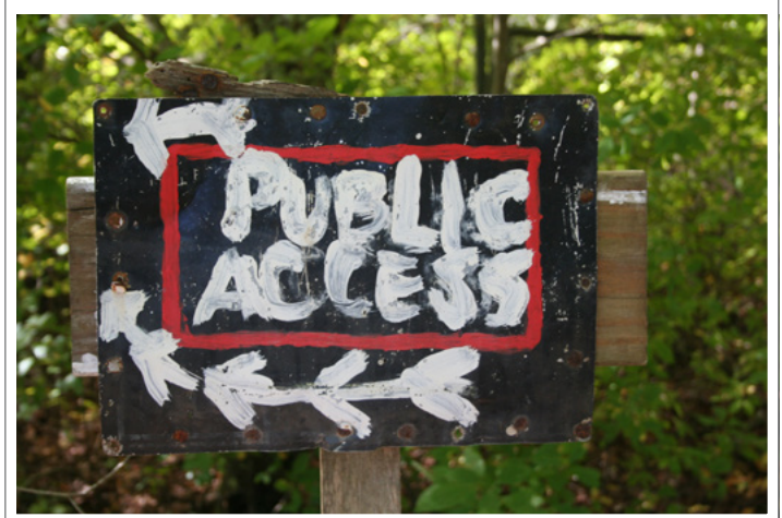
Top Left: There is no signage at the main entrance to Hawksnest State Park in Harwich; Bottom: Trails are not being maintained and official signage throughout the property is lacking